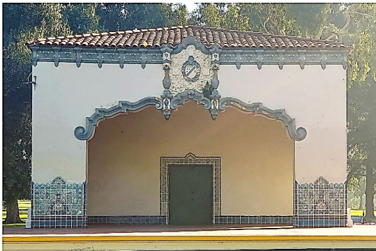
Stage Side Building

The Spanish Baroque Revival Bandshell was built in 1929 and is a Registered Historic Landmark