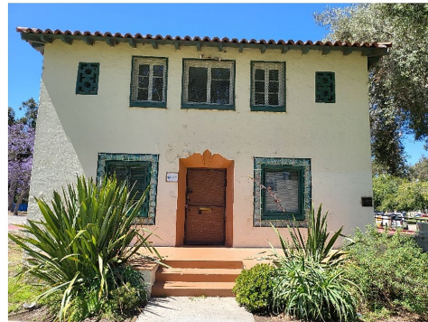
Street Side Building Entrance